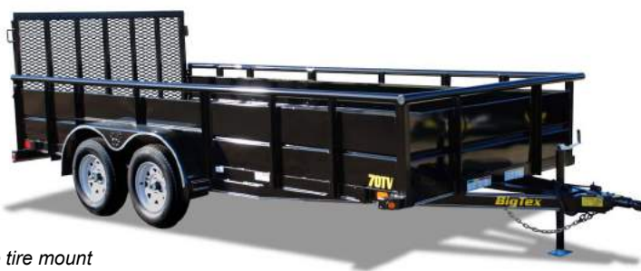
Shown with optional rampgate and spare tire mount